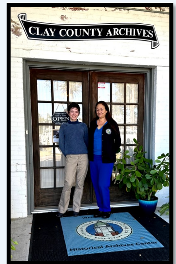
Historical Archives Division staff can assist you at their offices, located inside the 1894 Jail located at 21 Gratio Place in Green Cove Springs.