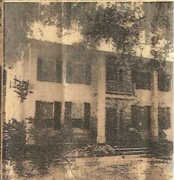
Successful and historic Middleburg, which celebrated its 100th anniversary close of World War I, has been awakened by World War II and the